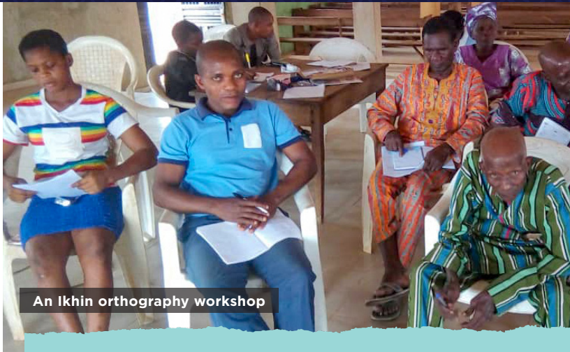
An Ikhin orthography workshop

1-2 Corinthians — The Apostle Paul's epistles to the church in Corinth will help deepen people's understanding of what it looks like to follow Christ, as well as encourage unity among believers.